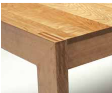
Model 100: Classic X-Pand line