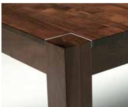
Model 200: Modern X-Pand line

The X-Pand line of tables for interiors is available in several different models, wood types and lengths. So there's one to meet your lifestyle needs and complement your décor whether it's modern or traditional. With X-Pand, you're all set to dine with a number of friends and family or an intimate get-together.